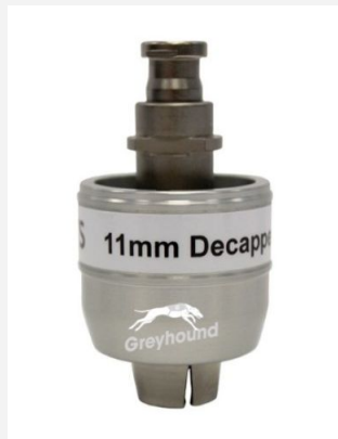
Decapper Jaw Set