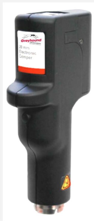
Electronic Crimper / Decapper with push button activation