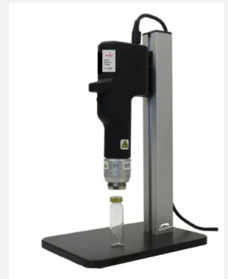
Base with Crimper attached