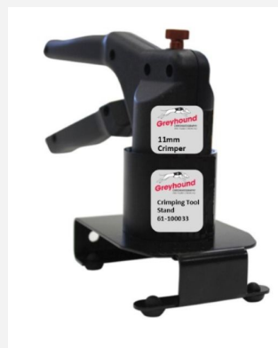
Part No. 61-100033 Crimper / Decapper Stand