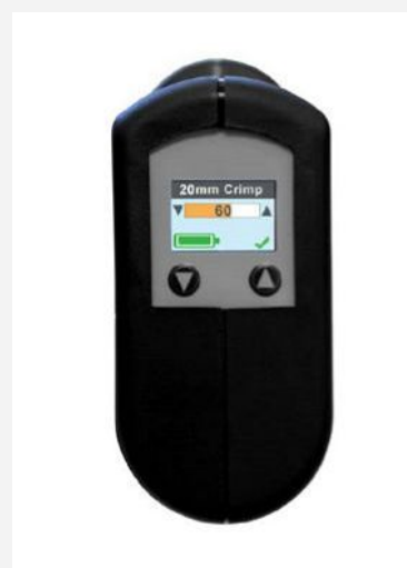
OLED Screen Display