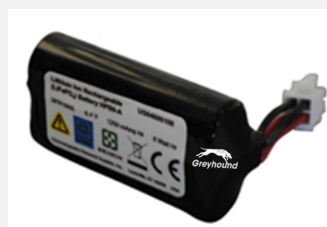
Part No. 61-100014 Lithium Battery 6.4 Volt