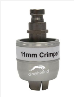
Crimper Jaw Set