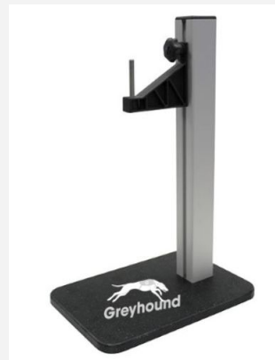
Base for Electronic Crimpers / Decappers