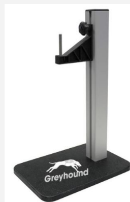
Part No. 61-100059 Base for Electronic Crimpers / Decappers