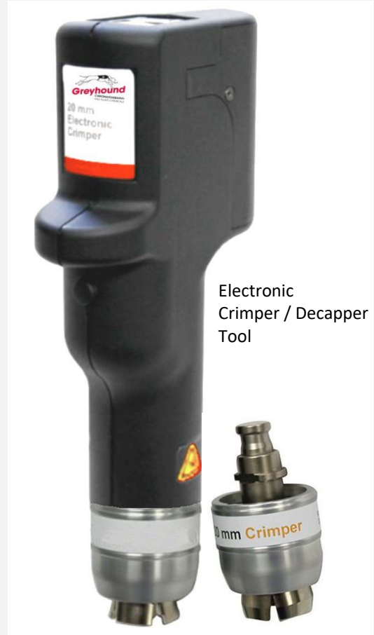
Electronic Crimper / Decapper Tool

Switching Jaw Sets: Jaw sets are easy to interchange. Simply insert the jaw set into the bushing at the bottom of the tool. Push up and twist until the set locks into position. To remove, simply push the outside button and rotate.